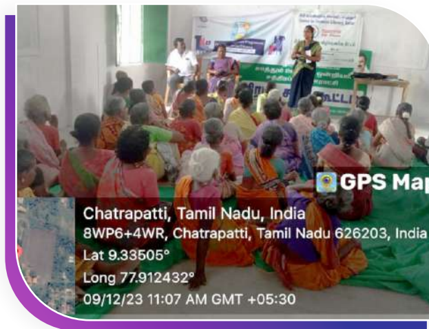
9th December 2023 Sattur, Virudhunagar