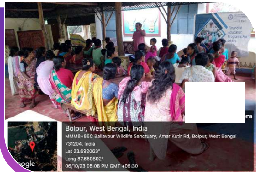
Rural Women, Bolpur - West Bengal