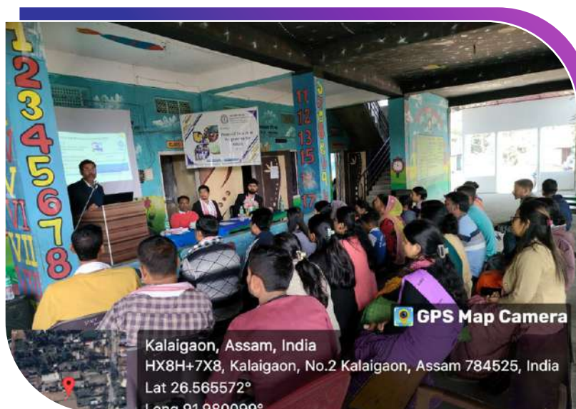
School Teachers, Kalaigaon - Assam