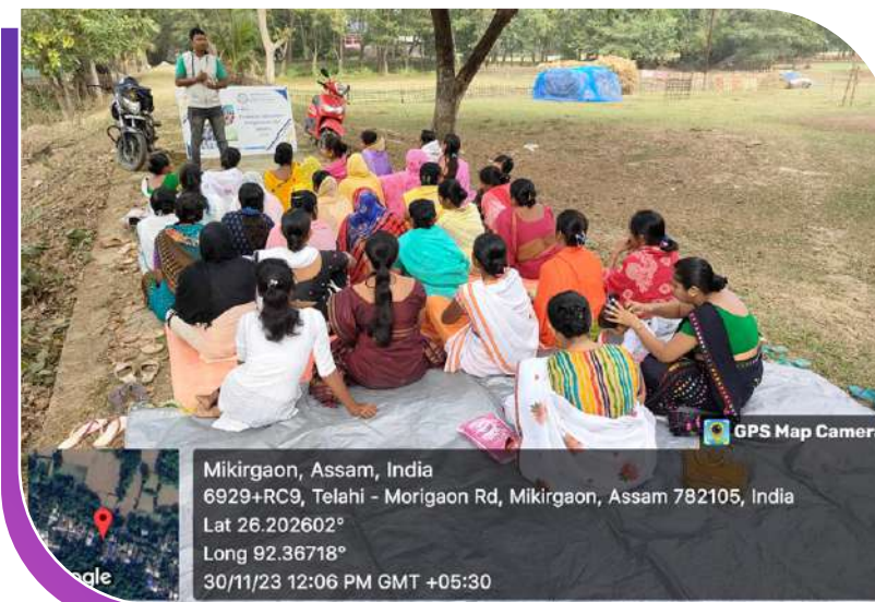
Women SHG, Mikirgaon - Assam