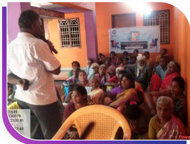
9th December 2023 Gudiyatham, Vellore