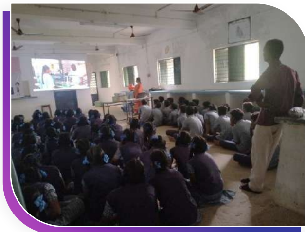
19th December 2023 Thalainayar, Nagapattinam