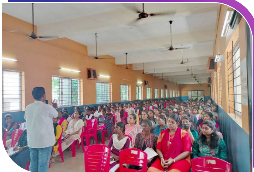
College Students, Korattur - Tamil Nadu