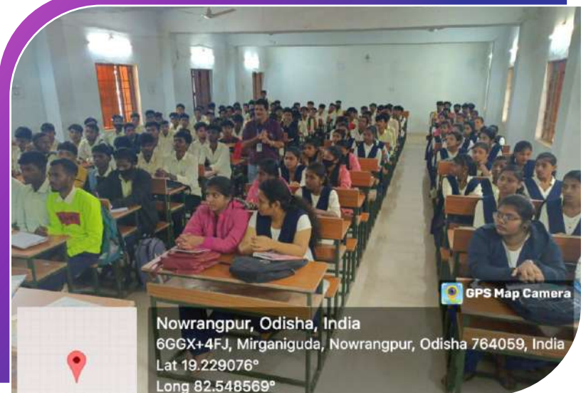
College Students, Nowrangpur - Odisha