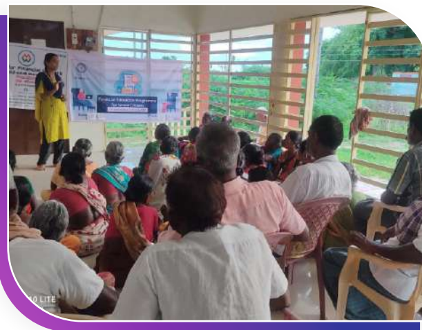
9th December 2023 Tiruchuli, Virudhunagar