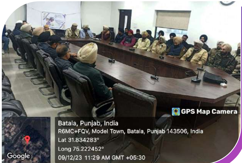
Police Personnel, Batala - Punjab