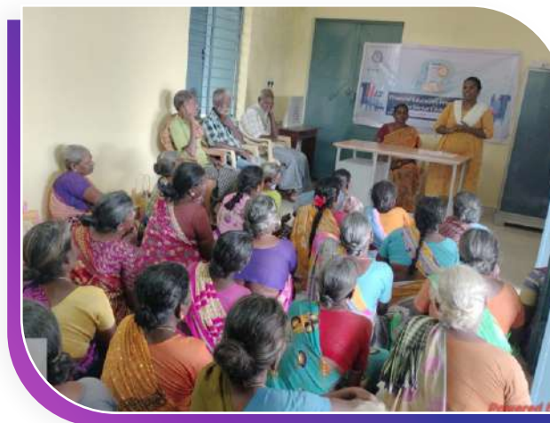
9th December 2023 Kanaiyambadi, Vellore