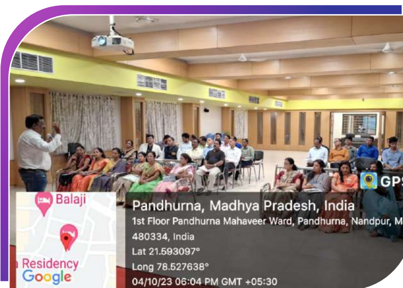
School Teachers, Pandhurna - Madhya Pradesh