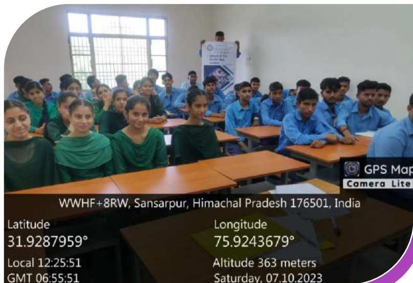
Skill Development Trainees, Sansarpur - Himachal Pradesh